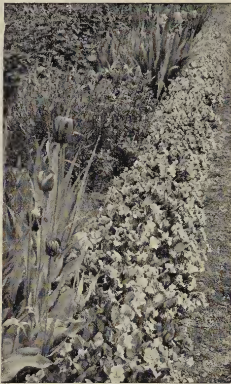
Border of Violas